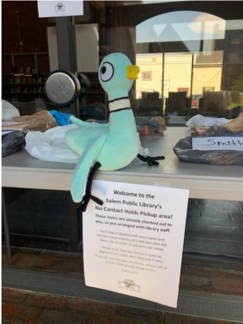
Non-contact pickup area