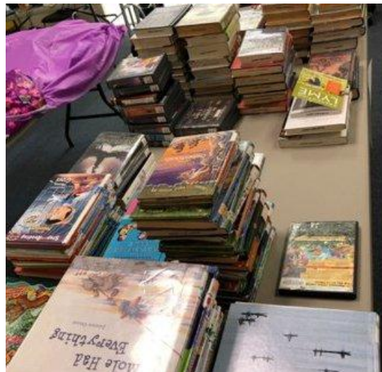
Books in quarantine