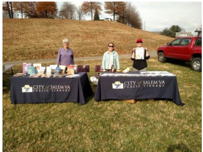
Gingerbread Festival at Salem Museum

All of the volunteers found the day to be exciting and a pleasant way to spend a beautiful Saturday. We are planning to do something similar in the Spring and are looking for members who would like to take part. Let me know if you are interested.