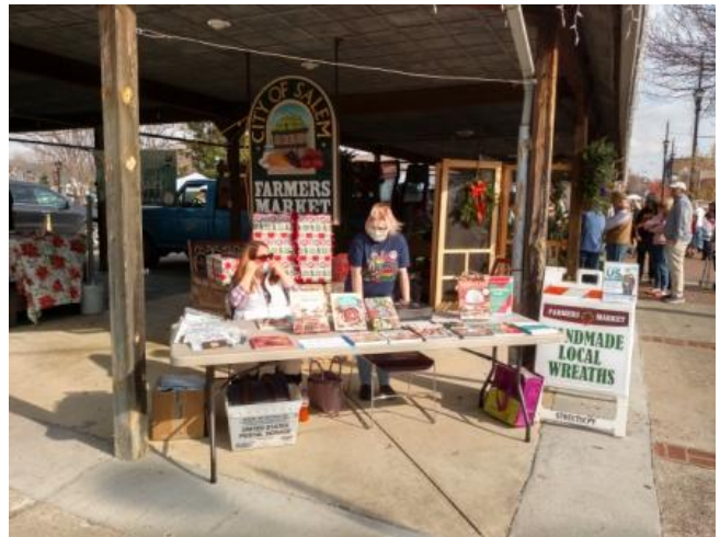
Crafty Christmas at Salem Market Square