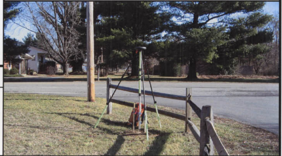
Photo of Station